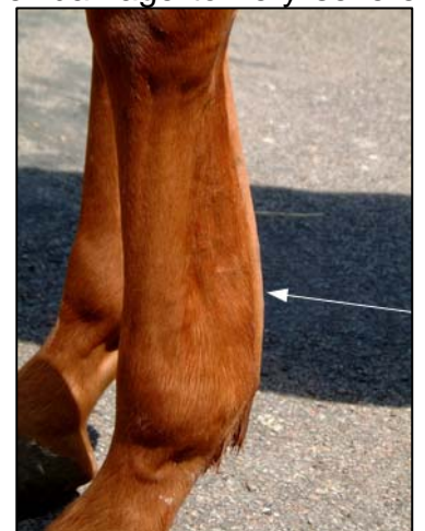
A bowed tendon