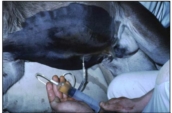
Urine being drained from a foal's abdomen

When bladder rupture occurs at birth, signs usually develop within 2 or 4 days of life. Colts are affected more often than fillies. If leakage of urine follows infection of the urachus, signs can develop later, but within a month of birth. Symptoms are caused by the accumulation of urine in the abdominal cavity rather than it being voided normally. This results in pressure on the diaphragm and toxemia as the waste products in the urine are reabsorbed into the foal's blood. Affected foals usually pass smaller-than-normal volumes of urine and adopt a fairly characteristic straining posture with the legs stretched out and the back flat. The abdomen becomes progressively more distended. The foal usually appears depressed and goes off nursing. Respiratory rate becomes more rapid and breathing can become quite labored particularly when the foal lies down as pressure builds up against the diaphragm. The heartbeat can become weak and rapid and cardiac arrhythmias can develop due to abnormalities in electrolyte levels in the blood. If left untreated, collapse and death usually follow.