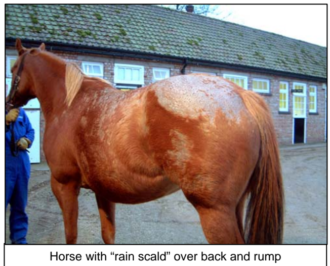
Horse with "rain scald" over back and rump

In mild cases, the horse's coat will feel like there are numerous BBs attached to the skin. These will progress to flat scabs containing mats of hair. They will be tightly attached and picking at them is very painful to the horse. As the scabs loosen and can be removed, they come out with a little tuft of hair and the underneath surface is moist and raw. In severe cases the coat over the horse's back and rump will feel hard and painful and will consist of many scabs lying next to each other. If the scabs are gently removed, the horse may be left with a large area of bare, raw skin.