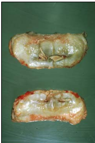
Post mortem navicular bones showing chronic damage

Navicular disease can be treated and managed, but rarely cured. Corrective trimming and shoeing is imperative to ensure level foot fall and foot balance. Often a rolled toe egg bar shoe is used to encourage early break over at the toe and good heel support. Medication such as phenylbutazone will elevate pain in many cases and enable work to be resumed. Long term treatment with substances such as isoxsuprine and aspirin may improve blood supply to the navicular bone and improve the condition of the bone.