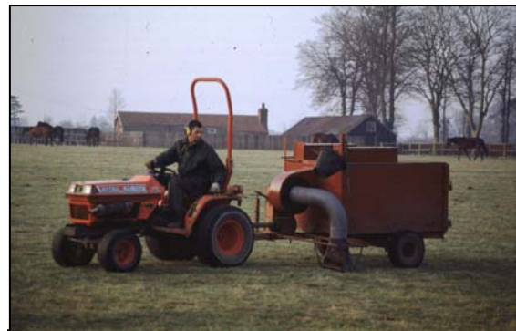
Mechanical removal of horse droppings from paddock

Removing the horses and allowing sheep or cattle to graze for a short period every six to twelve months encourages more even grass growth and can help weed control. It also helps to reduce the parasite load on the field since horses and ruminants are not affected by the same parasites. Potentially toxic plants such as ragwort or bracken should be removed immediately.