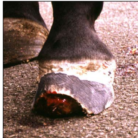
Keratoma visible as tumor mass after removal of overlying hoof wall.

Being a tumor (a cancer), the precise cause of this abnormal hoof cell growth is unknown, but some cases appear to follow injury to, or inflammation of, the coronary band. Fortunately these tumors are benign and do not spread to other areas of the horse's body.