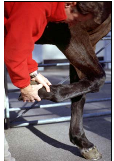
Veterinarian examining foot and pastern

Compound (open) fractures involve broken overlying skin, sometimes with the broken bone end clearly visible, whereas in closed fractures , the overlying skin is intact. Compound fractures are usually contaminated with environmental debris and infected with their microorganisms, making successful treatment and repair more difficult and therefore the prognosis less good and sometimes hopeless.