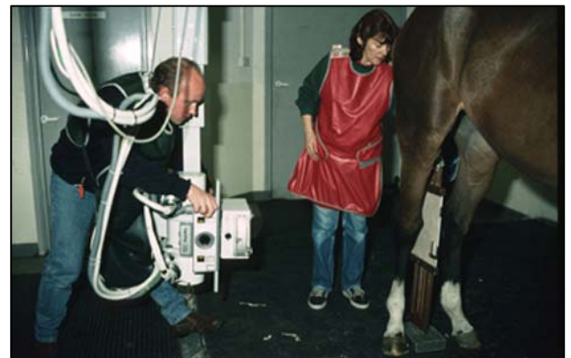
Radiographic examination of a hock

Olecranon (elbow) fractures are usually the result of a kick and are therefore often compound and comminuted. In simple, closed, non-displaced fractures, healing can occasionally occur with rest alone although best results are obtained following surgical fixation by inserting a plate and screws to pull the fragments together. Compound and/or comminuted fractures carry a poorer prognosis but surgical repair can be attempted.