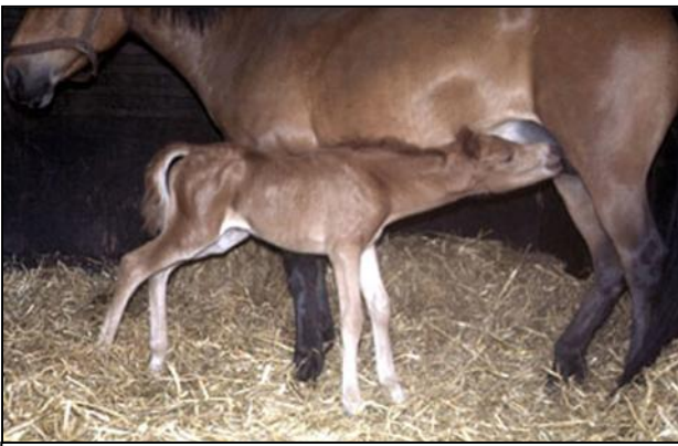
Foal sucking colostrum

Infected blood can also be transmitted by veterinary procedures, such as using contaminated hypodermic needles, stomach tubes, dental and tattooing equipment, or sleeves.