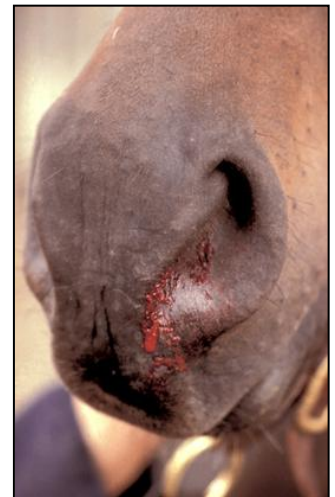
Bleeding from the nose (Epistaxis)

Exercise Induced Pulmonary Hemorrhage (EIPH) is a common condition that occurs in performance horses while at fast exercise. While EIPH often goes undetected, it can result in epistaxis. Hemorrhage is caused by rupture of capillaries in the lung due to the enormous differences in pressure that occur there during strenuous exercise. In most cases, the hemorrhage, although adversely affecting athletic performance, causes no illness. More severe EIPH may result from rupture of larger vessels and this may be fatal. EIPH is often diagnosed and monitored by regular endoscopic exam.