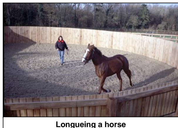
Longeing a horse

An endoscope is an instrument designed to look inside the body, in this case, into the respiratory systems. An endoscope consists of a bundle of optical fibers inside a waterproof rubber tube. Bright light produced by a connected light source is transmitted along the fibers to illuminate the area of the horse to be examined and then back along the fiber bundles to the eyepiece. An endoscopic exam