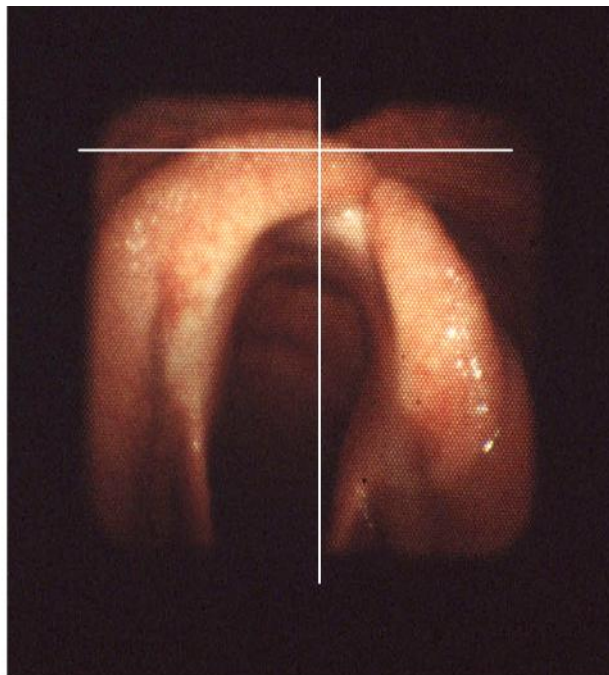
This horse has a paralysed left arytenoid cartilage. The cartilage is nearly vertical and barely moves at all even when the horse is made to breathe deeply

The appearance of the larynx will vary slightly, even in the same horse, between examinations. This means that during one examination, the larynx shows no signs of abnormality but at another examination it may show some premature weakening. The larynx may therefore be graded as a 'two out of five' during one examination and a 'three out of five' at the next, apparently 'jumping groups'.